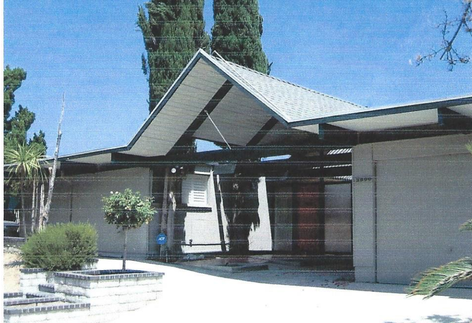
BALBOA HIGHLANDS. The latest historic district to get designated as a Los Angeles historic preservation overlay zone.

The Los Angeles City Council approved the designation of 108 Eichlers in Balboa Highlands, an area of Granada Hills designed between 1962 and 1964, as an historic preservation overlay zone. This is twenty-fifth overlay in Los Angeles, but only the second such designation for a collection of modernist houses in the city and the first of its kind in the San Fernando Valley. The other modernist HPOZ is Gregory Ain in Mar Vista. The designation comes after years of trying to get protection for the community, with initial proposals having been made in 2003.